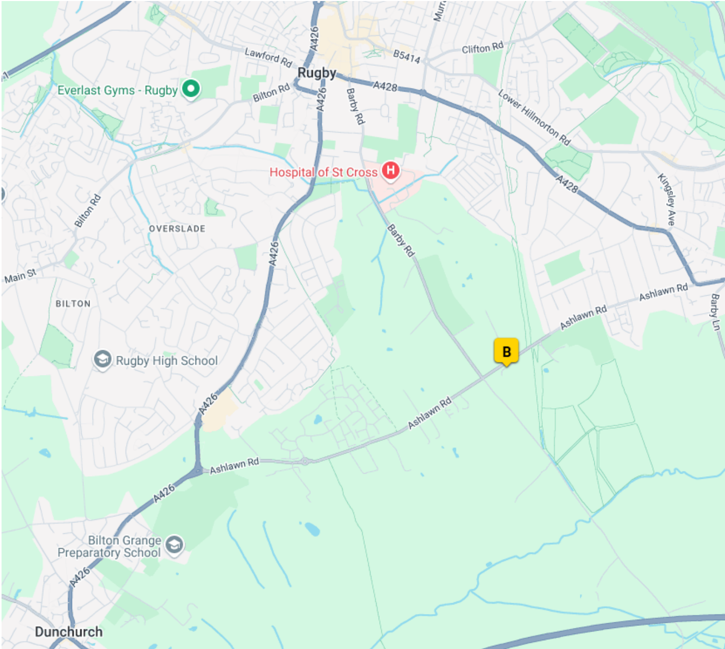
Google Maps - Rugby Riding Club