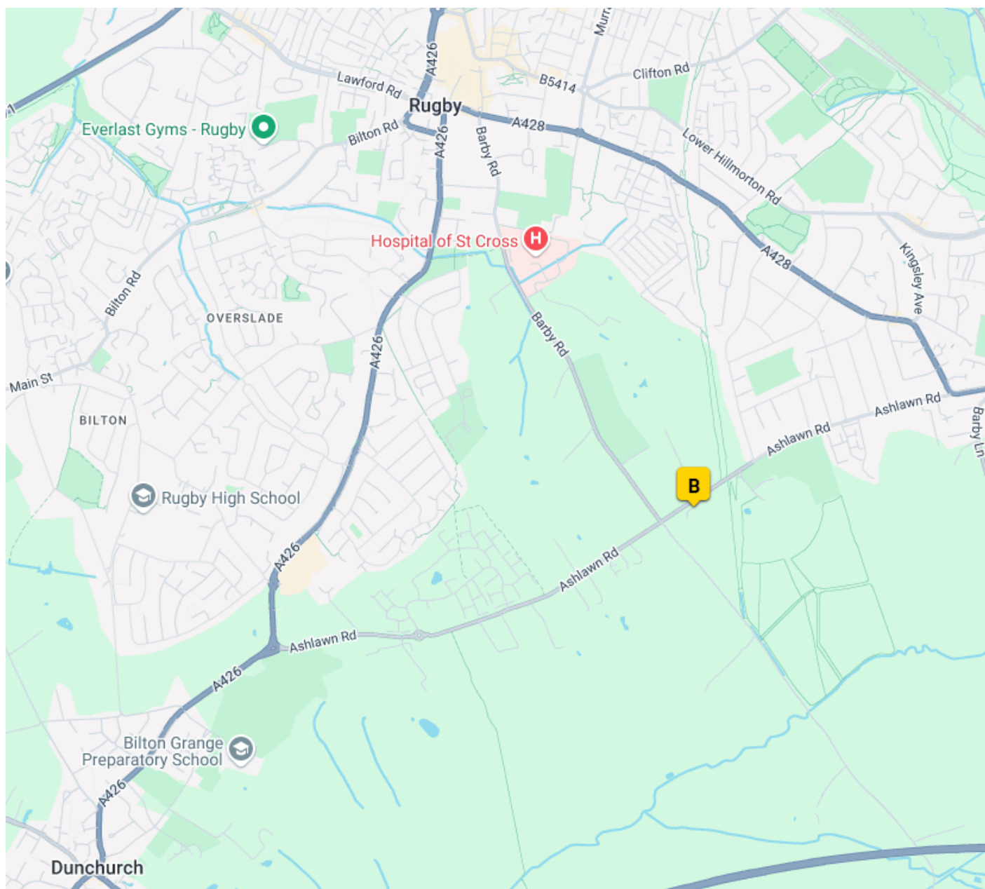
Google Maps – Rugby Riding Club